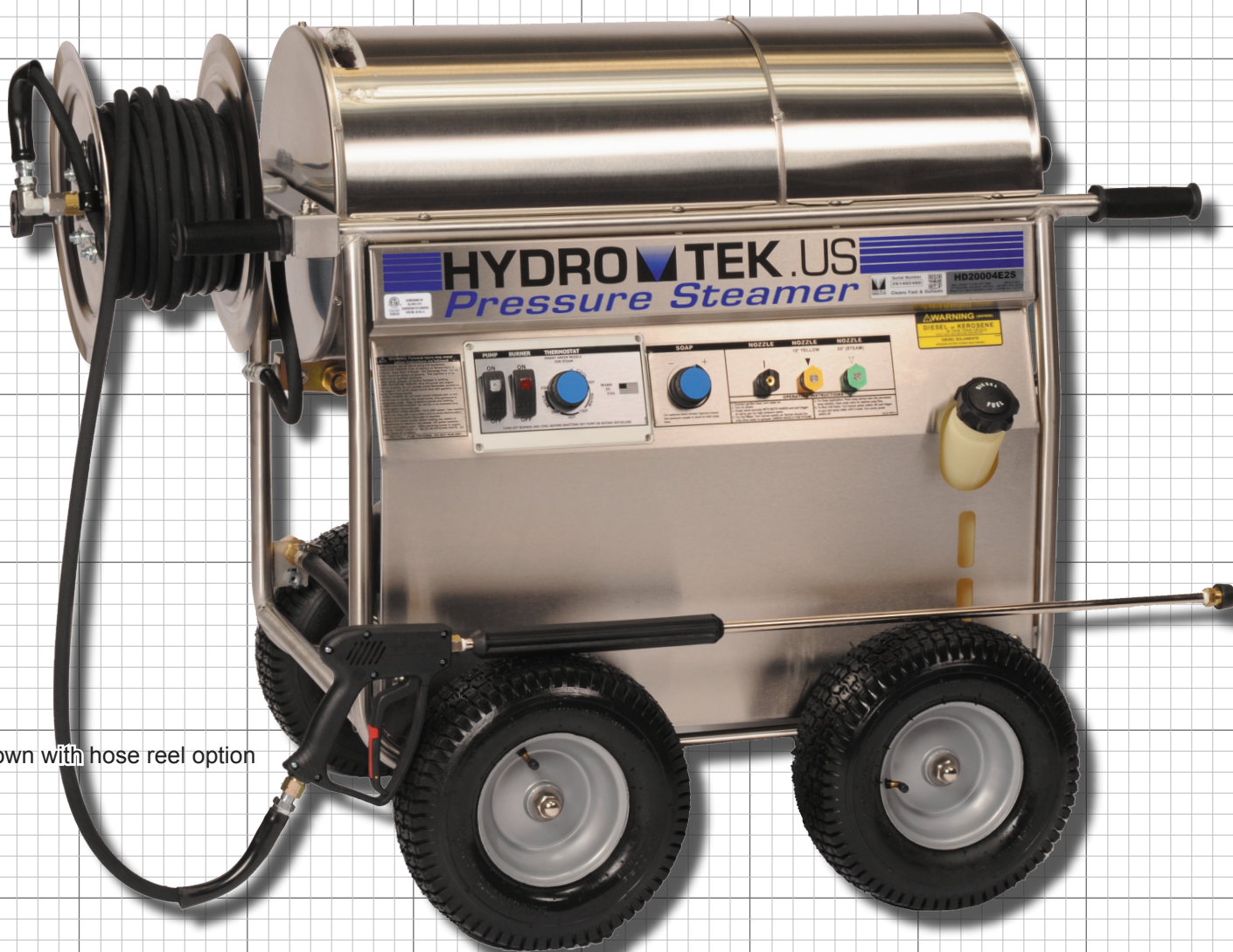
Shown with hose reel option